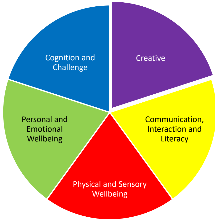
Curriculum Areas at St Giles